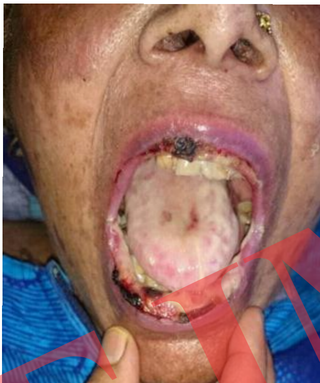
Figure 2: Desquamation of tongue with edema, crusting and bleeding of lips

with severe itching and mild pain. Gradually these rashes developed in bullae and blisters all over the body starting from face to hands and legs, then to abdominal region and to the back. She also developed purulent discharge from mouth and ulceration of buccal mucosa and desquamation of tongue (Figure 2).