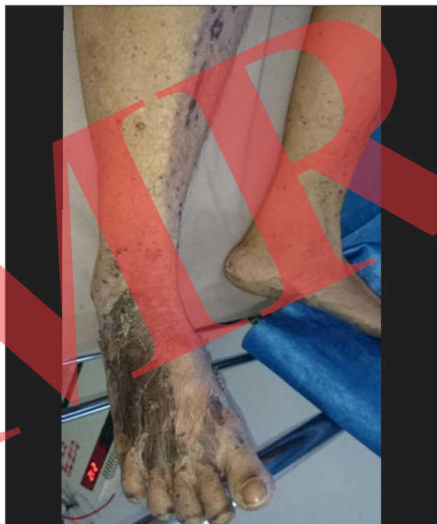
Figure 3: Crusting seen in lower limb

Gradually the condition of the patient improved and after 2 days, crusting of rashes, bullae and blisters started developing and edema, erythema and itching subsided. (Figure 3)