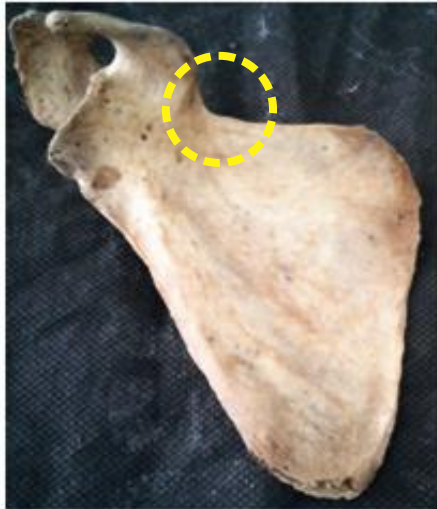
A. Absent suprascapular notch (type I)