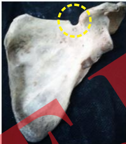
D. U-shaped suprascapular notch (type III)