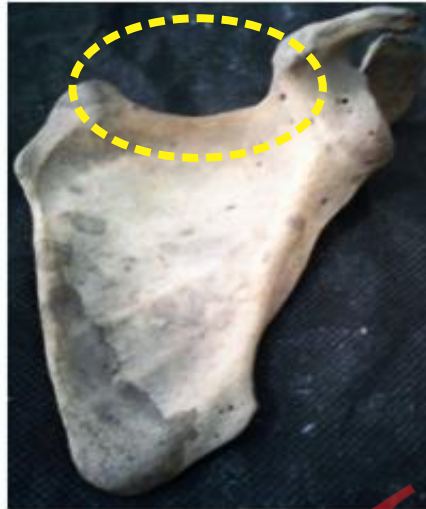
B. Indentation suprascapular notch (type I)