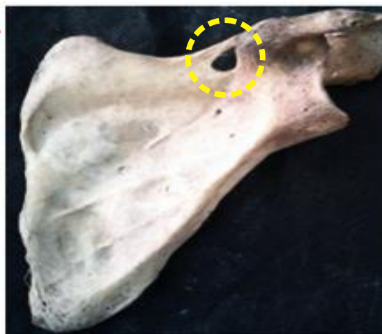
G. Complete suprascapular foramen (type VI)