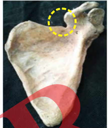
C. V-shaped suprascapular notch (type II)