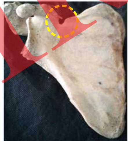
F. Incomplete suprascapular foramen (type V)