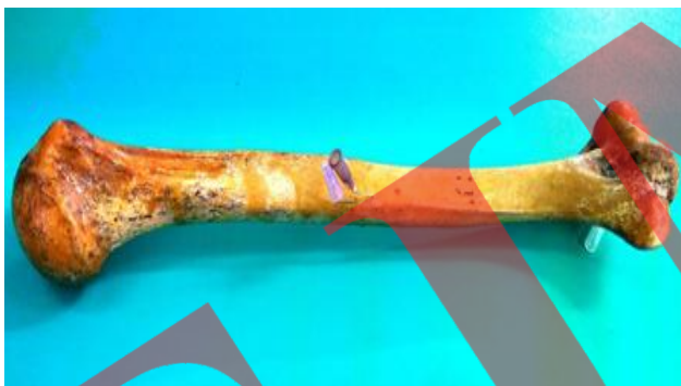
Figure. 2. Diagram showing nutrient foramen -

In humerus (37 bones) 97.4% bones have single nutrient foramen and only (1 bone) 2.6% bone has double nutrient foramen. While in case of radius (38 bones) 100% bones have single nutrient foramen. And all ulna (38 bones) 100% bones have single nutrient foramen.