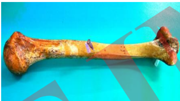
Fig. 2. Diagram showing nutrient foramen

In humerus (37 bones) 97.4% bones have single nutrient foramen and only (1 bone) 2.6% bone has double nutrient foramen. While in case of radius (38 bones) 100% bones have single nutrient foramen. And all ulna (38 bones) 100% bones have single nutrient foramen.